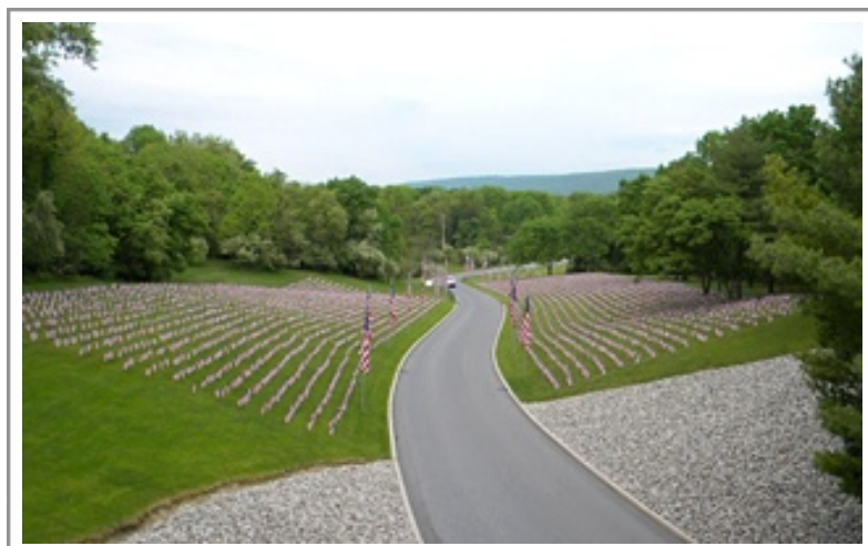
Nearly 7000 tribute flags lining the entry to the grounds of Indiantown Gap National Cemetery, in memory of all service members lost since 9-11-2001

Interior of the Pennsylvania Memorial where the group presents the musical and speaker's program.