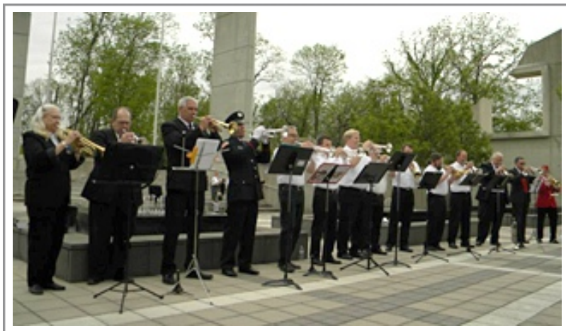
The Trumpet Choir performing during the musical program that follows the cascading Taps.