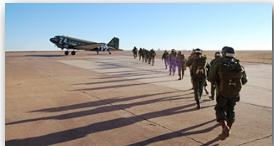
Paratrooper Trainees marching to the C-47 for a morning training jump. Frederick Army Air Field, Oklahoma. January 2014

The next jump school will be offered in July.