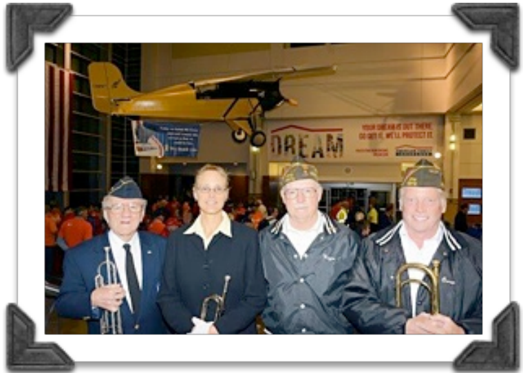
Buglers at Badger Honor Flight, September 13, 2014, Madison, Wisconsin