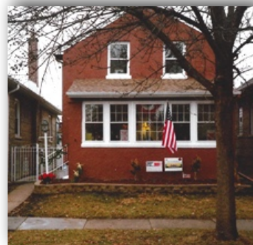
The new "Bugle Museum"

Tiger. We also have the horn that sounded Taps when President McKindley died. We have stories of the horn player who rode with the Lincoln Burial train 150 years ago. There are also many varieties of 1-valve, 2-valve, and 3-valve horns. Shelves display books and written history of the Bugle as a form of communication in use for hundreds of years. The display incorporates a place to watch bugle media and Drum Corps videos and listen to CD's.