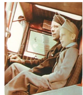
My dad and I