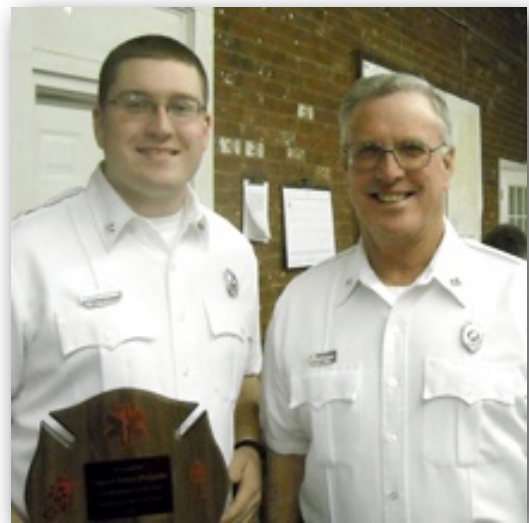
My dad and myself in 2009.

I am so proud to be a part of this amazing organization and all that it stands for. This is a worthy and noble cause that we are championing, and I look forward to serving BAA for many years to come. Thank you and God bless.