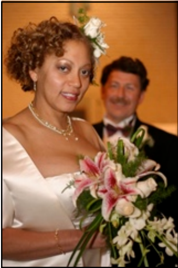
Our wedding, 5 May 2007.